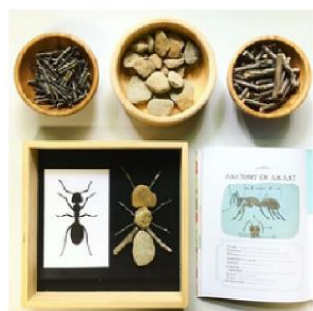
The silhouette of an ant was placed out with loose parts that would inspire children to create their own representation of an ant.

Loose parts are open ended materials like shells, blocks, fabric, beads, sticks, or stones that children can play with any way they choose. You can use loose parts to build, create art, or invent games. The key is to allow for unstructured play and exploration of the materials, allowing the children to explore their ideas without specific instructions. You can incorporate loose parts into a provocation as seen in the picture to the left.