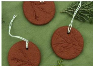
HOW TO MAKE CINNAMON DOUGH